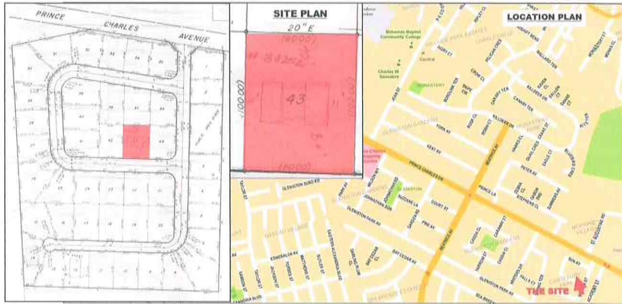
Compiled by TR Associates August 2024